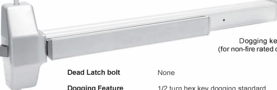
Dogging key (for non-fire rated devices)