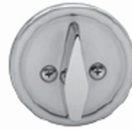
DBT-50 (Thumb Turn)