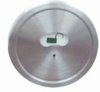
DBT-70 (Indicator outside)