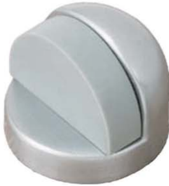
TSH438 (High Dome Stop)